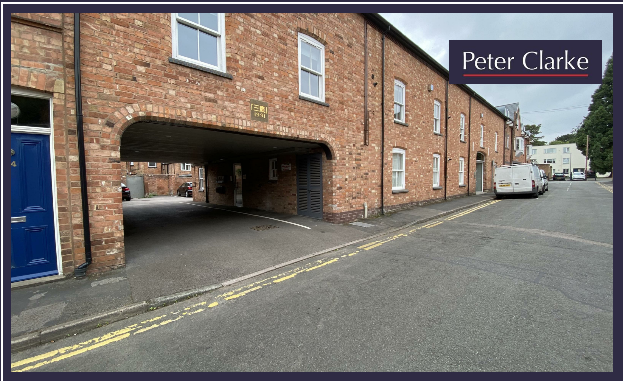
14 Mitaka House Morton Street, Leamington Spa, Warwickshire, CV32 5TP